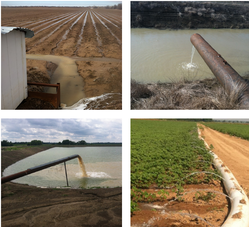
Figure 1. Water movement through a TWR system. Note that not all TWR systems have the same components. Some TWR systems are comprised of only a large TWR ditch and no on-farm storage reservoir (OFS). Top left: Nutrient- and sediment-laden water running off a field in the Mississippi Delta region. Top right: Runoff water being captured by a TWR ditch. Bottom left: Nutrient- and sediment-laden water being pumped into an on-farm storage reservoir. Bottom right: Surface water being irrigated from a TWR/OFS system.

recycling precipitation and irrigation runoff (Figure 1). In addition to storing water for irrigation, these systems have the potential—and have been funded—to reduce nutrient runoff leaving the agricultural landscape.