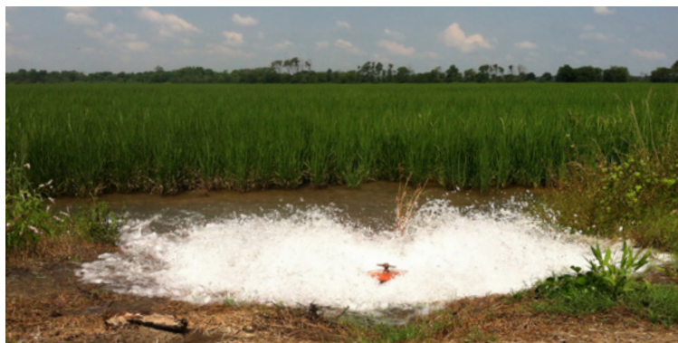
Figure 6. Rice irrigation with water from a TWR system in the Mississippi Delta region.

Tailwater recovery systems are a combination of conservation practices that can provide water-quality and water-conservation benefits, but they also require economic investments. The cost of TWR implementation is higher than other conservation practices to achieve similar nutrient-reduction benefits. Other conservation practices to help achieve water-quality goals include controlled drainage and developing a comprehensive nutrient management plan. Consult your county USDA-NRCS agent for more details on conservation practices.