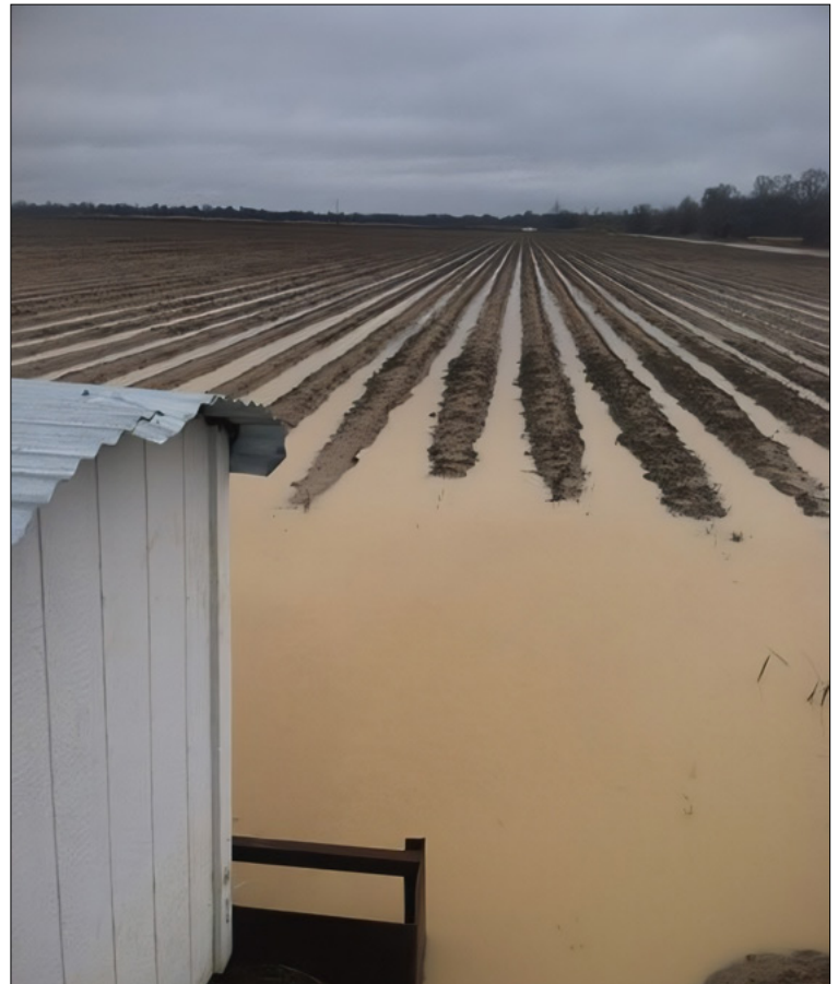
Figure 4. Runoff leaving a field after a precipitation event in the Mississippi Delta region. The small building on the bottom left houses water-quality sampling equipment used to monitor runoff leaving the field and entering the TWR system (not pictured).