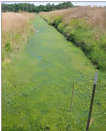
Figure 2. Plant and algal growth in TWR ditches in Mississippi's Delta region.