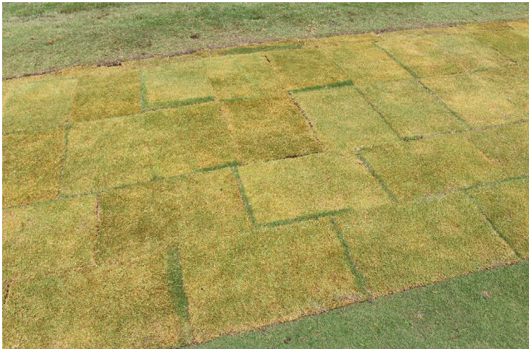
Figure 2. Correctly staggered sod seams. Notice that this sod has been on a pallet for several days but will still recover if adequate moisture is applied immediately after laying. ff

When laying squares or rolls, it is important to stagger ends (Figure 2). Erosion potential is greatest in straight lines, so it is especially important to avoid creating straight channels oriented down a slope. It is best to orient the first row of sod being installed along a straight edge, such as a street, or parallel to the front of the home. Save trimming and edging for last. Use a straight-edged shovel or machete.