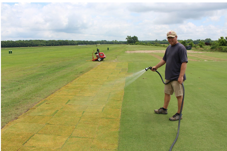
Figure 3. Hand watering is the best means of ensuring the success of newly laid sod. Water until soil becomes soft.

A common question is, “How long should I wait before I water?” During the summer months, the answer is: Don’t wait to water! Someone should be watering newly installed sod while others lay it (Figure 3). Professionals will often wet the soil lightly before any sod has been laid.