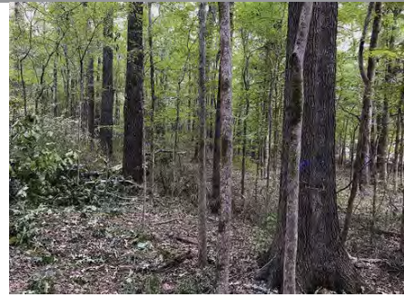
Figure 5. This is a hardwood stand with trees marked for a high grade. Note the lack of any large, higher-value trees left unmarked.

Call 662-841-9000 by 12 PM on Friday, May 1st to reserve your seat. Save the date for our fall Forestry meeting, Monday, August 3rd, at 6 PM.