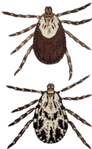
Figure 3. Rocky Mountain wood tick, Dermacentor andersoni , female (top) and male (bottom).

The Rocky Mountain wood tick ( Dermacentor andersoni ) is found in western North America from about British Columbia and Saskatchewan south through North Dakota to northern New Mexico, Arizona, and California. It looks similar to the American dog tick but is not found in Mississippi ( Figure 3 ).