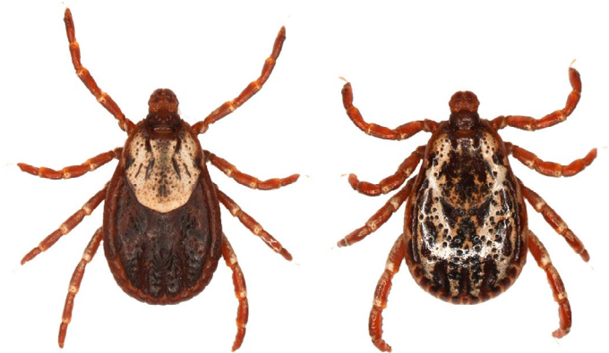
Figure 2. American dog tick, Dermacentor variabilis , female (left) and male (right).

The American dog tick ( Dermacentor variabilis ) is one of the most widely distributed and common ticks in the eastern and central U.S. and parts of the West Coast. Adult American dog ticks feed on medium to large animals, people, and their pets. They are reddish-brown and have silvery-gray or whitish markings on their backs or upper bodies ( Figure 2 ). Adults are almost one-fourth of an inch long, so they are usually easy to see. Female ticks increase dramatically in size as they obtain their blood meal from a host animal, reaching half an inch in length and resembling a dark pinto bean.