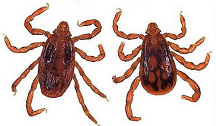
Figure 4. Brown dog tick, Rhipicephalus sanguineus , female (left) and male (right).

The brown dog tick or kennel tick ( Rhipicephalus sanguineus ) is found almost worldwide and throughout the entire U.S. ( Figure 4 ). Domestic dogs are the principal host for all three stages (larva, nymph, adult) of the tick, especially in the U.S., although the tick feeds on other hosts in other parts of the world. On dogs, adult ticks feed mainly inside the ears, on the head and neck, and between the toes, while the immature stages may feed almost anywhere on the dog, including the neck, legs, chest, and belly. People may occasionally be attacked.